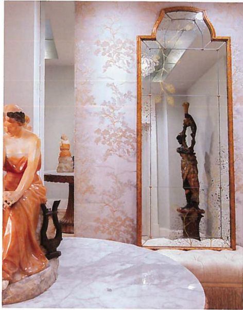
A living room (right) is anchored with a large, round contemporary rug colored in neutral tones with cobalt accents as shown in the sculpture "Venus Bleue" by Yves Klein. Classical antiques in bronze and marble are seen in the entry foyer (above) and master bedroom (below).