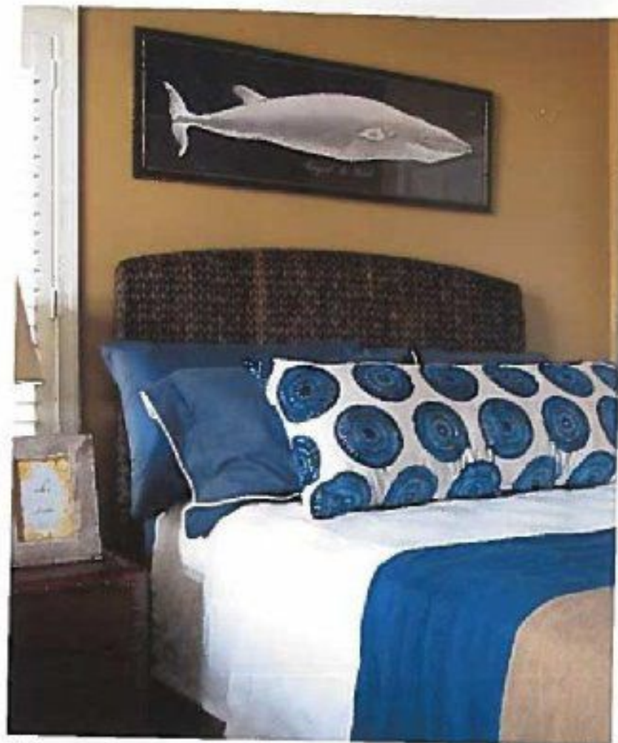
Rich caramel-colored walls complement a whimsical vintage whale print and rattan bed frame in a guest bedroom (above), while a tall linen panel in another bedroom is used as a headboard (below), emphasizing the room's height over its small footprint. In a family room (right), a sectional and a custom iron-and-stone cocktail table create a comfortable spot for gathering.