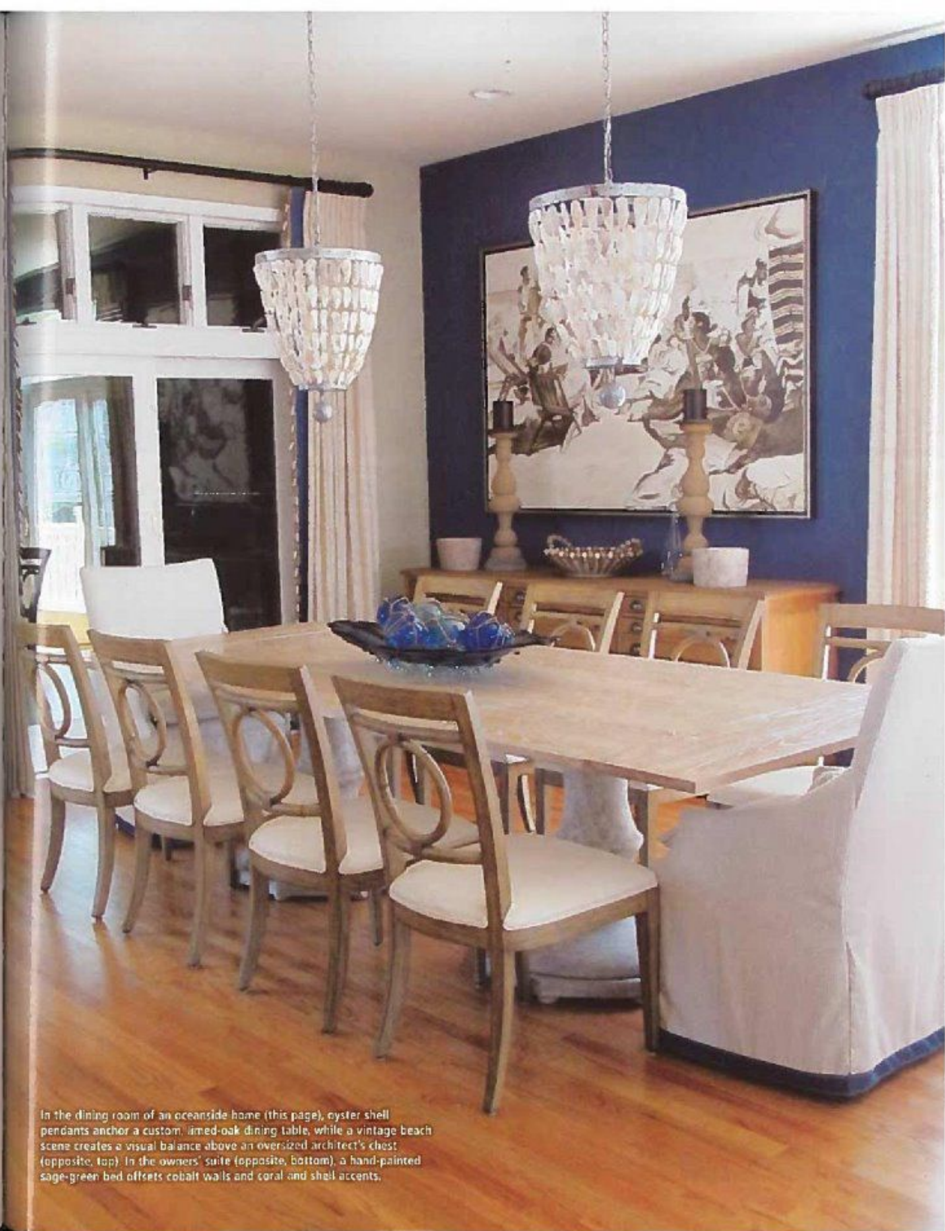
In the dining room of an oceanside home (this page), oyster shell pendants anchor a custom limed-oak dining table, while a vintage beach scene creates a visual balance above an oversized architect's chest (opposite, top). In the owners' suite (opposite, bottom), a hand-painted sage-green bed offsets cobalt walls and coral and shell accents.