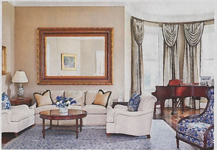
From top: The Pences' basketball court doubles as an event staging area. The Hoosiers logo is removable. The living room features down-filled upholstery, and taupe and gold silk curtains.