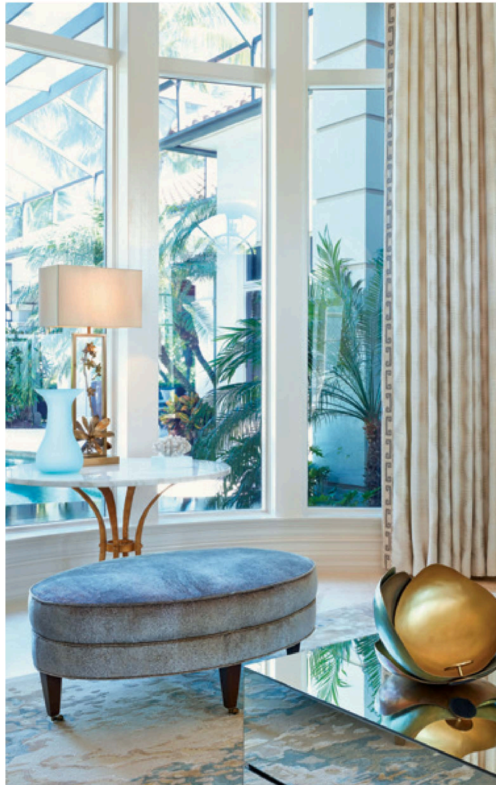
Interior Concepts, Inc., designed a residence in Naples, Florida, to reflect its casual, warm-weather locale. Reflective surfaces add freshness to the living room (above), where a vibrant abstract painting (opposite) inspired the blend of color, pattern and texture.