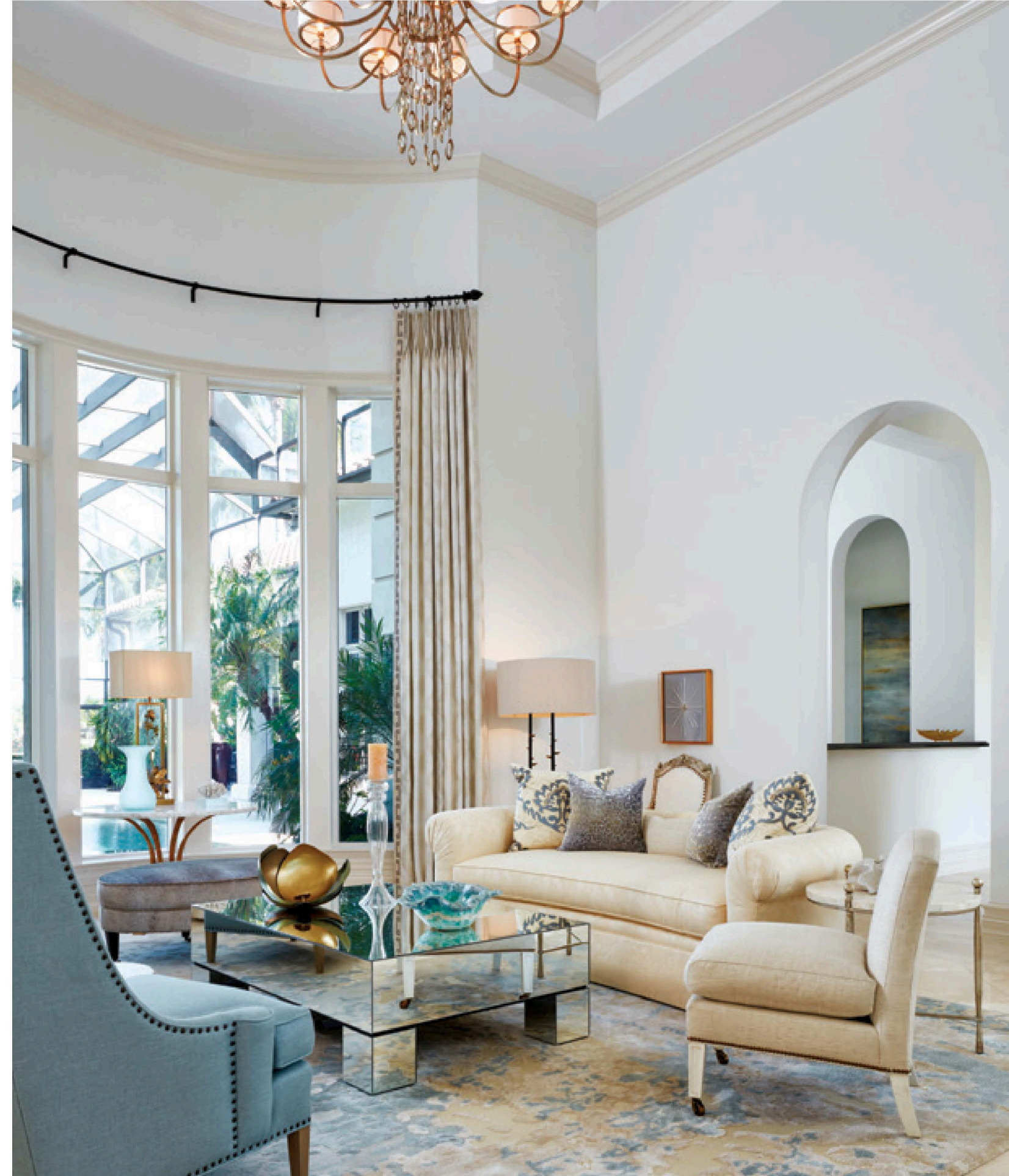
The two-story living room (above) conveys drama via brilliant hues inspired by the Florida waters. The dining room (opposite) showcases a fresco painting on the wall; it complements the chair fabric and a gold objet d'art on the table in a similar leaf pattern.